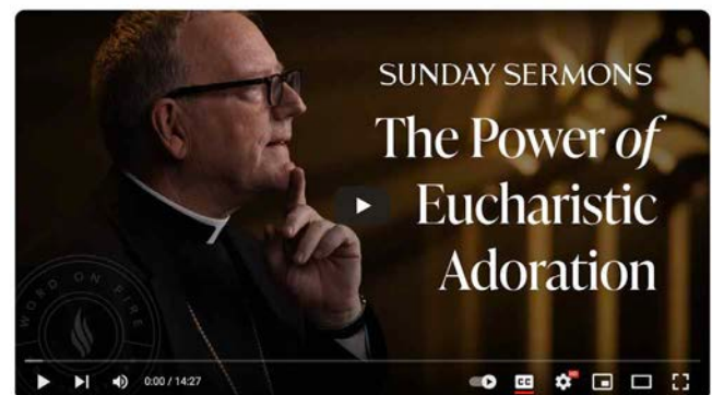
The Power of Eucharistic Adoration - Bishop Barron's Sunday Sermon

Weekly Adoration Hosts: Parish Council (first Tuesday); St. Vincent de Paul (second Tuesday); Women of St. Andrew (third Tuesday); Men of the Parish (fourth Tuesday); First Called Youth Ministry (fifth Tuesday).